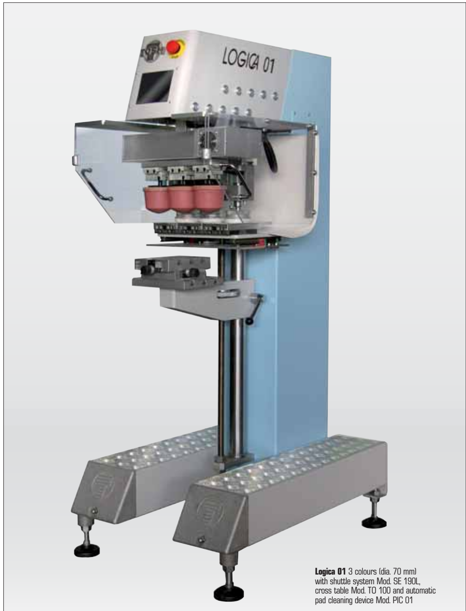
Logica 01 3 colours (dia. 70 mm) with shuttle system Mod. SE 190L, cross table Mod. TO 100 and automatic pad cleaning device Mod. PIC 01